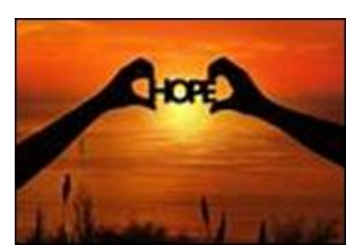
*Please Pray with us that we can cling to His HOPE when there seems to be so little in this particular situation.

It is in moments like this that we are again reminded of so many of His ALIVE and ACTIVE WORDS from His BOOK OF LIFE; that sets our feet on solid ground and anchors the tumultuous thoughts bombarding our minds. It is in our WEAKNESS that His STRENGTH shines through it is through our cracks that He is made known, it is with the feeble weakness of our hands that make mighty His Handiwork! Why? Because everything, good and bad, ultimately have one purpose...to bring Him Glory! And brothers and sisters, it is upon these Truths that we are choosing to REST.